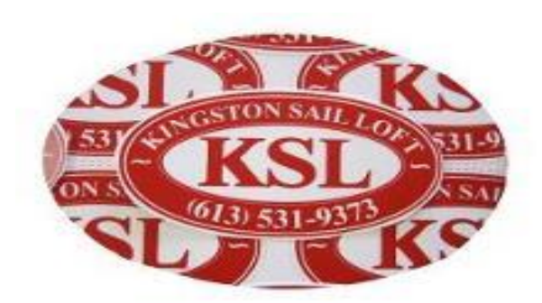
774 Baker Crescent, Kingston, ON

Crusing is a great way to increase your/our stash of boat porn