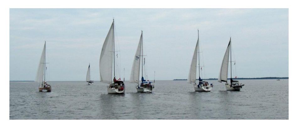
July 21 (Tuesday) – Sackets Our arrival Henderson at Harbour to Henderson Harbour Harbour Yacht Club was

We were asked to leave Navy Point Marina by 12:00. Due to sailing school activities, we were asked not to arrive until 15:30 at Henderson Harbour. Innisfree What to do? organized a head-sail only race which turned out to be a delight. It was light winds. A group of seven got into synchronized sailing ("the Black River Boat Waltz"). understand it was magical. In the captain's word, Niaid IV "smoked across the fleet on the last leg of the race". Others wondered if the mad dash mutiny was a practice A few of our group had session for the Pirate Cruise.