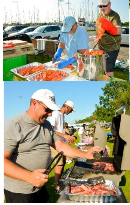
Click here for more photos