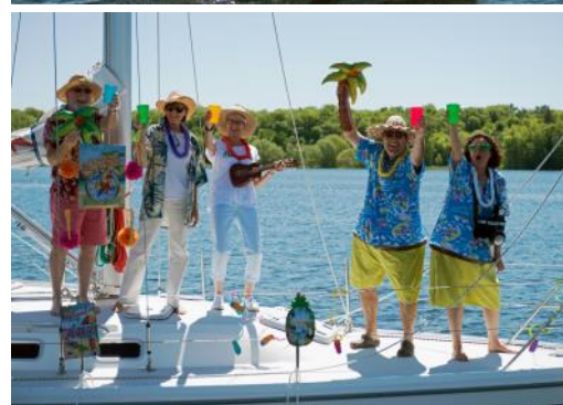
visibility dancing tourists and to