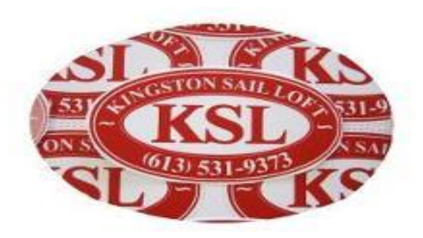
774 Baker Crescent, Kingston, ON

Look for us on Facebook, on Twitter @str8eyes, and at www.str8eyes.ca