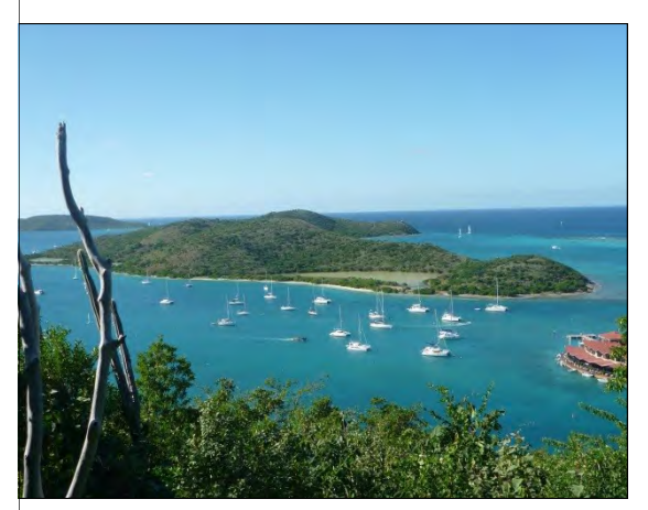
Anchored behind Saba Rock, British Virgin Islands