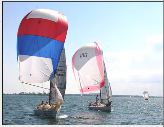
Close Finish Anniversary Regatta—Investors Group & O'Naturel

If a tie remains between two or more boats, they shall be ranked in order of their scores in the last race. Any remaining ties shall be broken by using the tied boats' scores in the next-to-last race and so on until all ties are broken. These scores shall be used even if some of them are excluded scores.