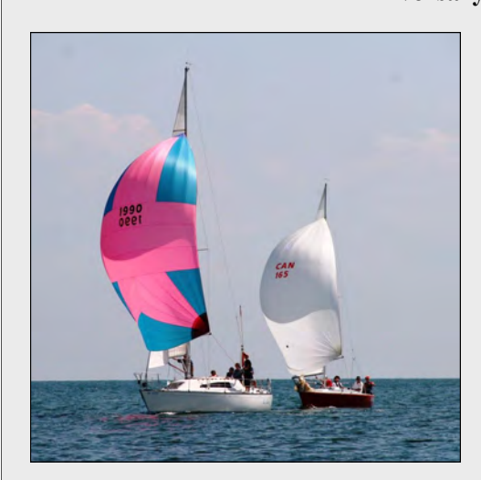
Spinnaker Duel - Lei Line and The Baron