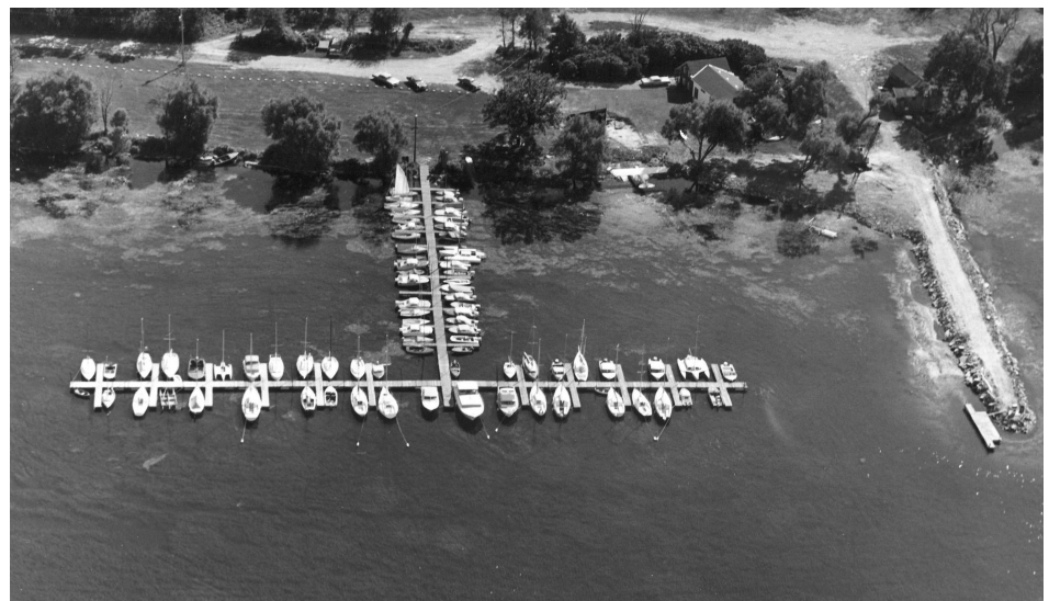
Collins Bay Marina circa 1972

ethanol based fuel or higher priced premium. They were 100% in favour of switching to premium fuel to avoid ethanol issues. In the spring of 2011, we will order premium grade to be able to