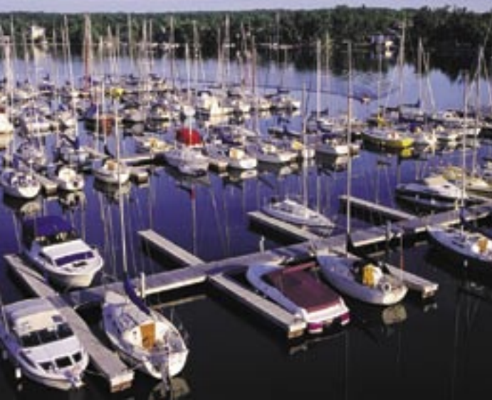
Custom-built docks – built by the marina owners.

its second audit achieved five anchors at a time when only 12 out of more than 300 marinas achieved such an accolade.