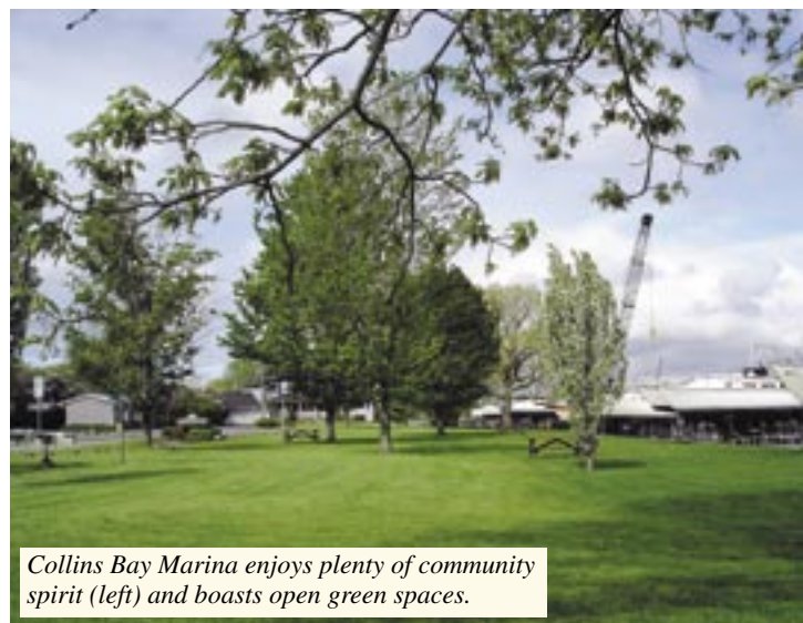
Collins Bay Marina enjoys plenty of community spirit (left) and boasts open green spaces.